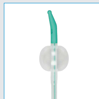
Balloon volume: 5-30 ml