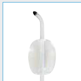
Balloon volume: 40-70 ml