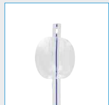
Balloon volume: 05-10 ml