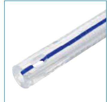
Central open tip, integral balloon