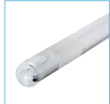
Central open tip, integral balloon