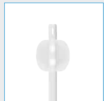
Balloon volume: 03-05 ml