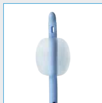
Balloon volume: 05-10 ml