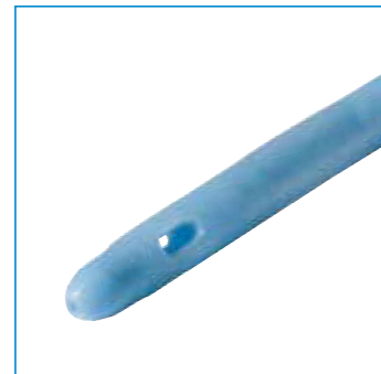
Dilatation tip with central bore, integral balloon