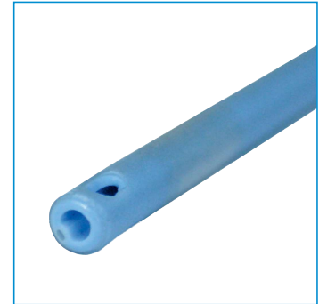
Central open, integral balloon