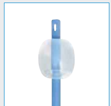
Balloon volume: 05-10 ml