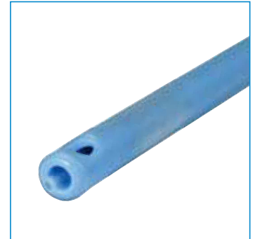
Central open tip, integral balloon