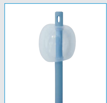
Balloon volume: 05-10 ml

Packaging Unit: 10 pieces Packaging: sterile