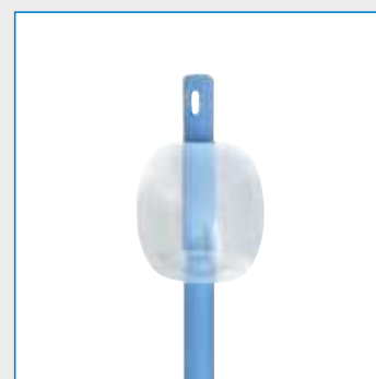
Balloon volume: 05-10 ml