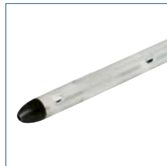
Dilating nelaton tip with central bore, integral balloon