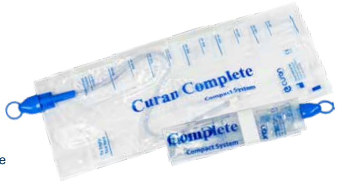
Curan Complete compact system Collection bag: 1.000 ml