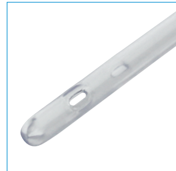
Atraumatic, rounded drainage eyes